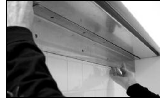
Photo 2b - Angle Bracket