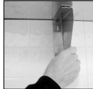
Photo 2a - Cantilever Bracket

(NOTE: Hardware for wall mounting not provided)