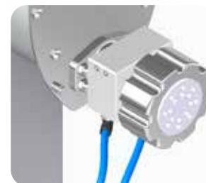
Frio 5: Optional head cooling kit

ON/OFF stainless steel keypad, IP 67 waterproof protection, no-volt release FWD(mixing)/OFF/REV(extrusion) rotary cam switch