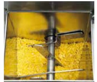
Mixing hopper designed to better knead pasta dough