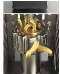
Pasta Cutter Accessory