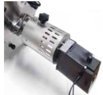
Pasta Cutter optional

The bowl is quickly disassembled and removed completely