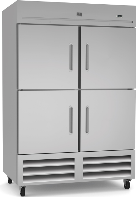
738282 (KCHRI54R4HDR) 4-Half Door Full Height Refrigerator 54" Long