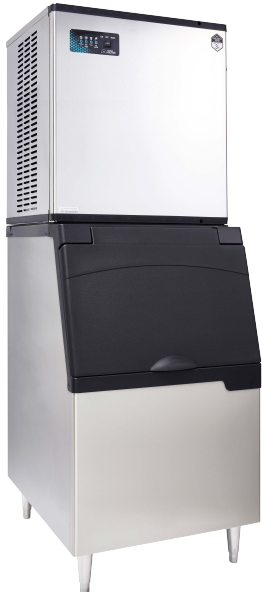
ICETRO IM-0460-22 ice machine on a IB-026-22 bin