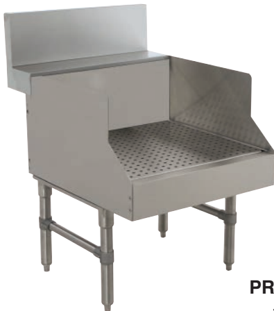
PRGS-24 Series 30" Wide Units