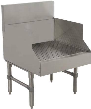
PRGS-19 Series 25" Wide Units