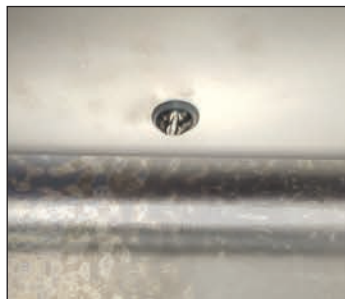
Basin Sensor Activates When Water Falls Below 2" Level