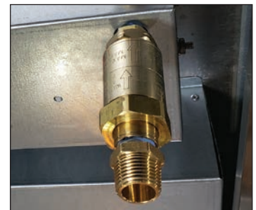
Supplied 1/2" NPS Water Inlet