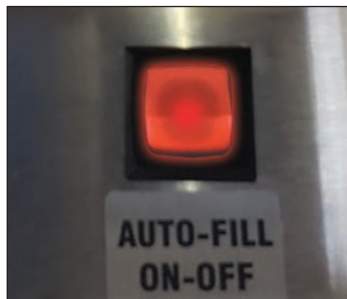
Illuminated On/Off Button

A Manifold Drain (-M) Option is required in order for the Auto-Fill to correctly function. (Included on HDSW Series and not required for DISW-1 Series)