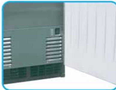
Power switch at the bottom right when the door open