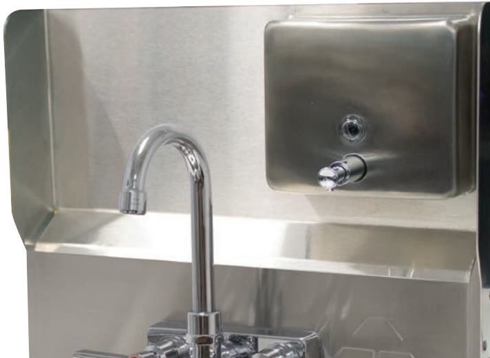
Unit mounts to Existing Back Splash of Hand Sink (Fits Sinks with 10" x 14" Sink Bowls)

(For Advance Tabco Hand Sinks With 10" x 14" Sink Bowls Only)