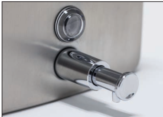
Includes K-13 Soap Dispenser