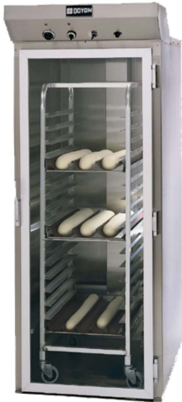
Proofer Cabinet, Roll-In, One-Cavity, Single (1) Rack Capacity or (36) 18"x26" Sheet Pans, Solid State Heat & Humidity Controls, Auto Water Entry, Full View Glass Door, Stainless Steel Interior and Exterior, Aluminum Floor, NSF, cETLus, ETL