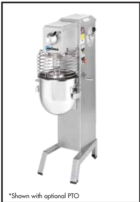
*Shown with optional PTO