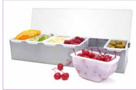
CDP-6 shown filled