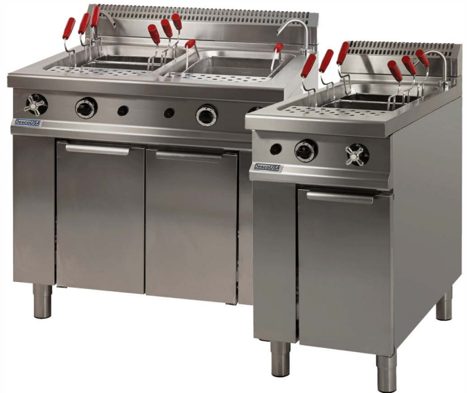
Models CPG-2/90 & CPG-1/45

All of our units were designed to be simple to operate, long lasting, and cost effective. This is why all of our units are built without any costly electronic components that tend to perform poorly when placed in a hot and humid kitchen environment.