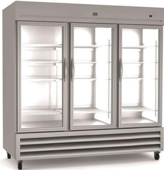
738315 (KCHRI81R3GDR) 3-Glass Door Full Height Refrigerator 81" Long