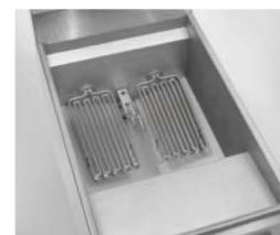
Immersed element models are the lowest cost alternative for electric fryers.