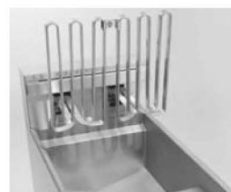
Tilt-up elements provide full access to the frypot for cleaning.