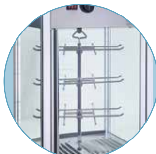
EDM-2PR Optional Pretzel Rack