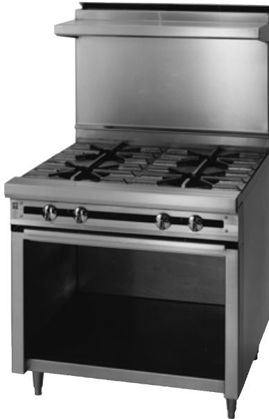
JTRH-4 with optional high shelf

TITAN CABINET BASE OPEN BURNER RANGE (18" SECTIONS)