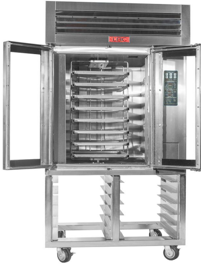
Model LMO-G8-N-S Shown