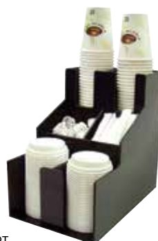
CLSO-2T 8-1/2"L x 13-1/16"W x 12-3/16"H