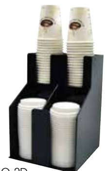
CLO-2D 8-1/2"L x 8-5/8"W x 12-1/4"H