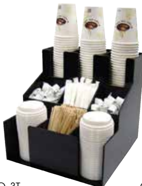
CLSO-3T 12-5/16"L x 12-3/4"W x 13-1/8"H

Organizers fit cups / lids up to 4" diameter