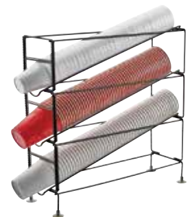
CDR-3 20"L X 6-1/4"W X 19-1/4"H