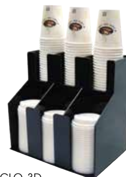
CLO-3D 12-11/16"L x 8-5/8"W x 12-1/4"H