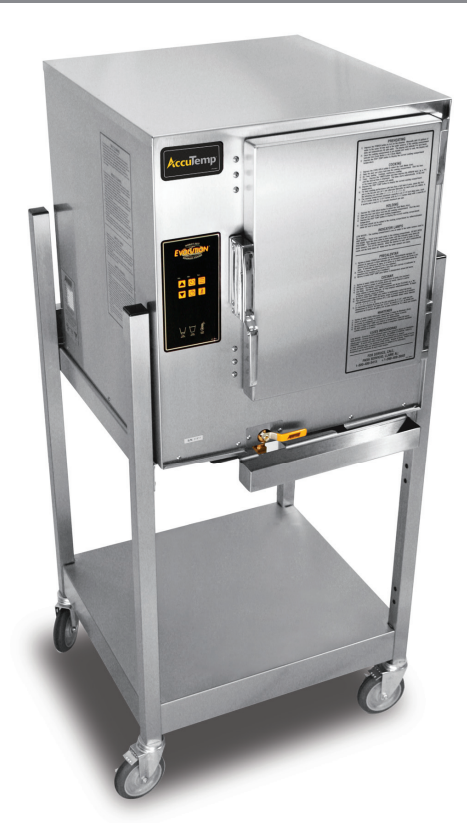
Stand-Mounted E6 Evolution™

Standard digital controls with independent timer. No water quality exclusions to warranty and no water filtration or treatment required. Unit to be UL Safety and Sanitation Certified, and Energy Star qualified. Built in USA.