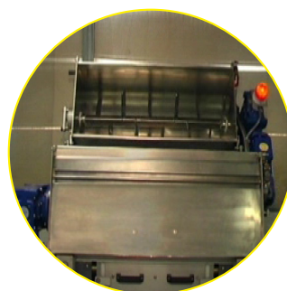
Extra Mixer ADSM160