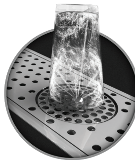
Integrated water glass rinser