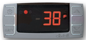
Adjustable Digital Thermostat! Easy to read exterior mounted