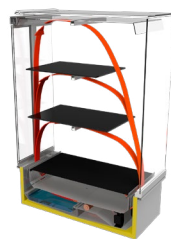
Hot Blanket holding technology