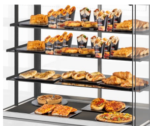
Four presentation levels