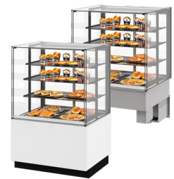
Floor model or drop-in version