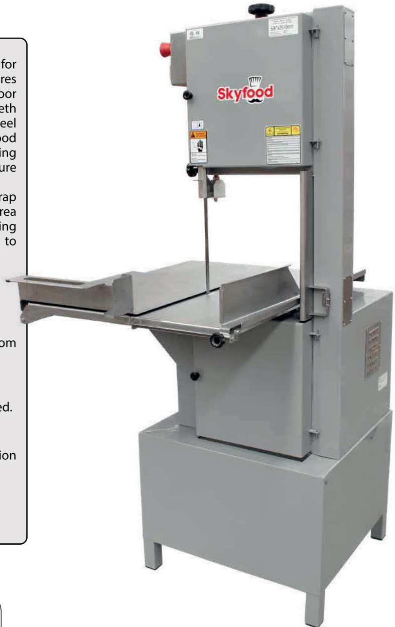
SKEX MEAT AND BONE SAW