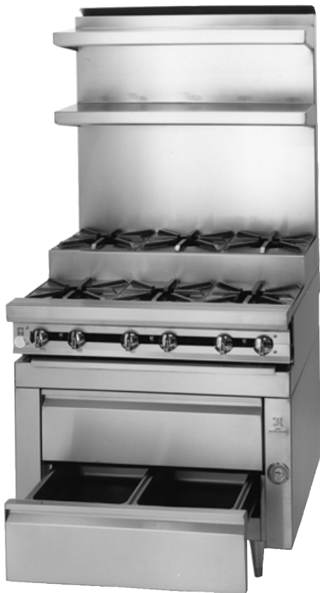
JMRHE-3-3 with double high shelf and mounted on JRLH-02R-T-36