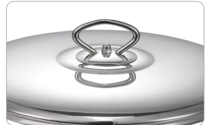
Elegant, Mirror Finish Stainless Steel