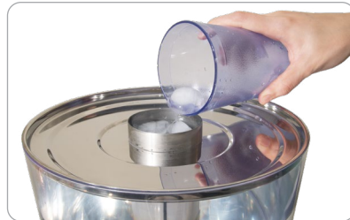
Center Ice Core Keeps Drinks Chilled without Dilution