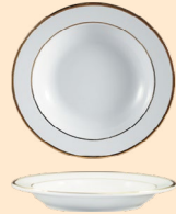
SOUP PLATE GRY-3 9" x 1⅝" / 10oz / 2dz