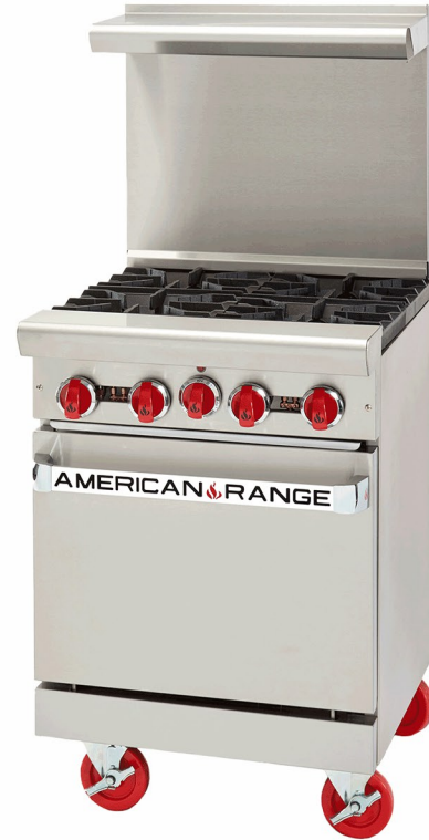
Model Shown AR-4