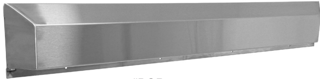
#BGR-48-6 bumper guard rail