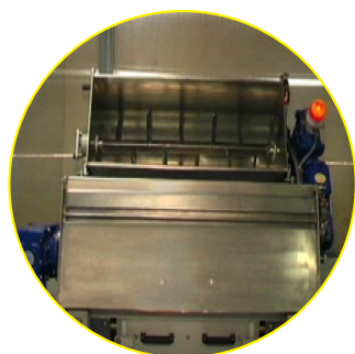
Extra Mixer ADSM320