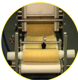
Automatically rolls down onto rolling pin