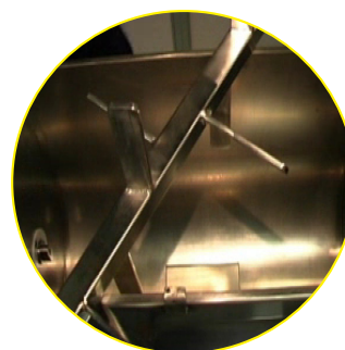
Removable Mixing Shaft