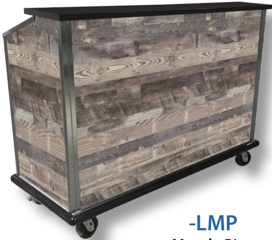
-LMP Marula Pine Exterior front & sides only

Add model number at end of Portable bar model number when ordering & add additional cost. (Example: AMD-6B-LCW)