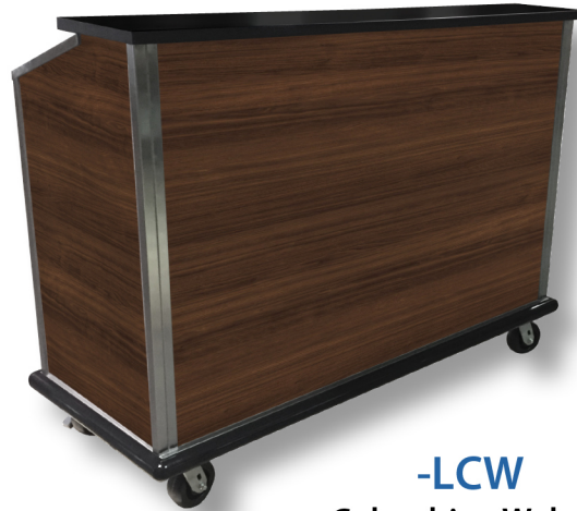
-LCW Columbian Walnut Exterior front & sides only