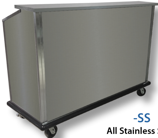
-SS All Stainless Steel Including Top