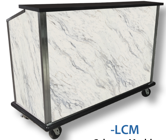
-LCM Calcutta Marble Exterior front & sides only