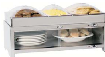
Model CMLB-CSLP Warming Cabinet with Mid-Size Buffet Server (plates not included)