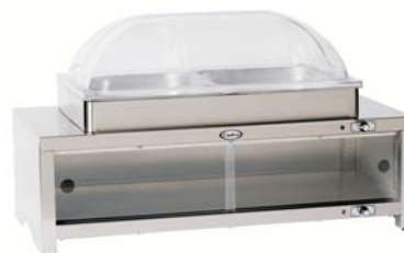
Model CMLB-C2RT Warming Cabinet with Buffet Server with Low Profile Roll-top Lid