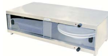
Model CMLW-C Warming Cabinet with Mid-Size Warming Tray (plates not included)