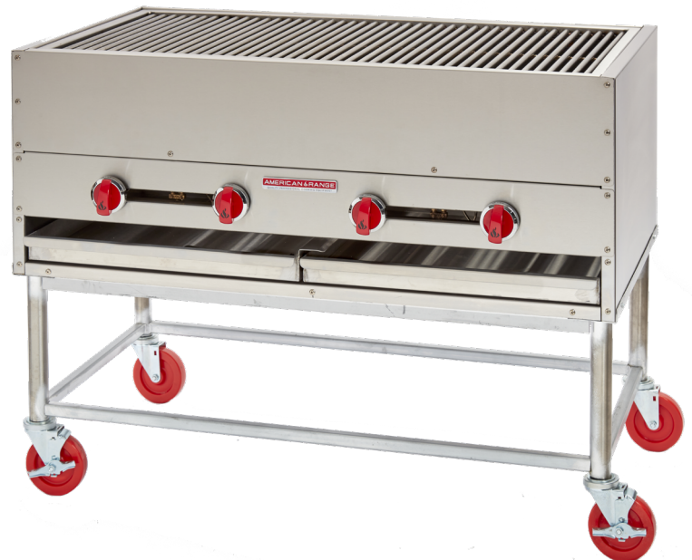
Model AHS-4836 (shown with optional stand and casters)