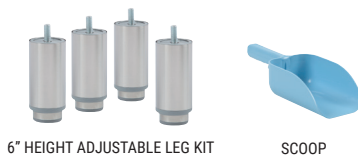
6" HEIGHT ADJUSTABLE LEG KIT