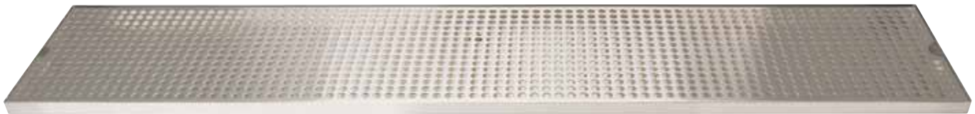
Stainless Steel DP-820D-51