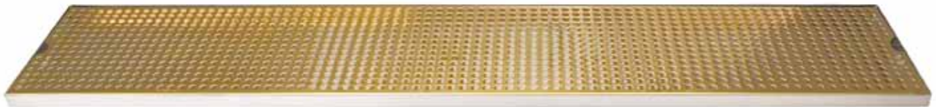
PVD Brass DP-820DSSPVD-51