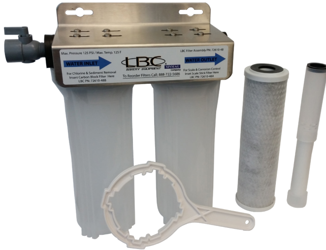
72610-48 Filter System Shown