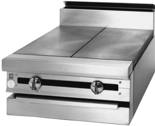
JMRH-2HT-A (shown without legs)