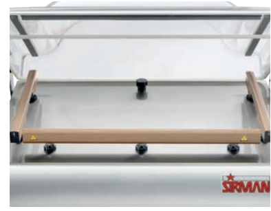
W8 70 DX TB 3 seal bars design