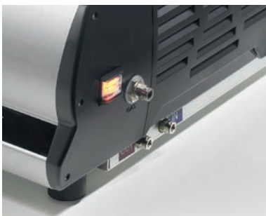
W8 Top 40-50 DX G Option inert gas and A.O.R.