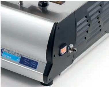
W8 50 DX G with inert gas flush ready