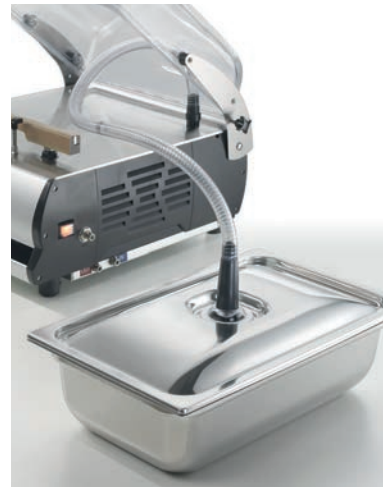
External vacuum: hose + GN container + lid Reinforced Gastronorm Containers and s/steel Lids