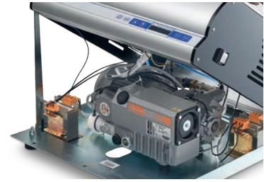
Easy access for oil change and service