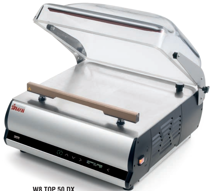
W8 TOP 50 DX