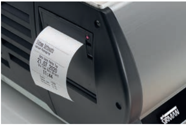
Thermal label printer - option