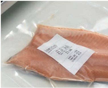
Optional adhesive paper for built-in printer