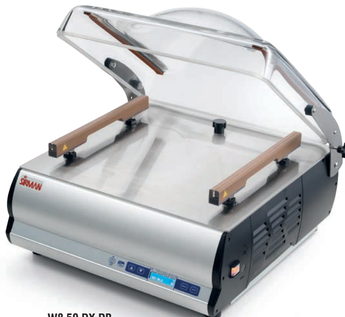
W8 50 DX DB

Exclusively designed with a stainless steel 304 flat vacuum chamber, the easiest to clean in the market Thick transparent dome for viewing the process from start to finish Digital LED display, water resistant. Electronic millbar sensor Built-in cycle counter with oil change reminder Removable seal bars Slide for liquids comes standard