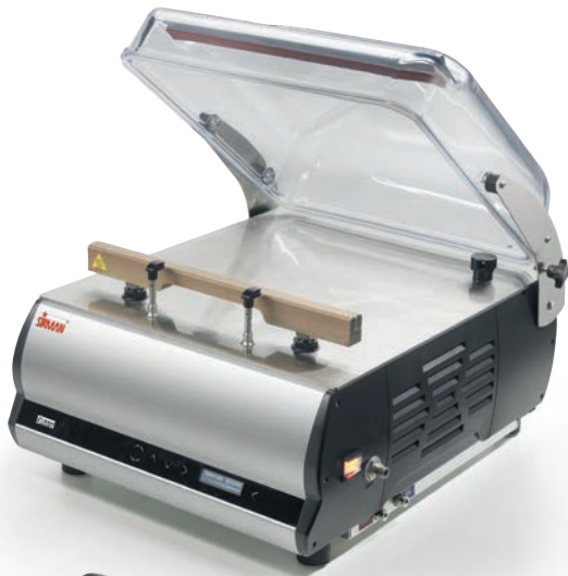
W8 TOP 40 DX with inert gas and AOR options