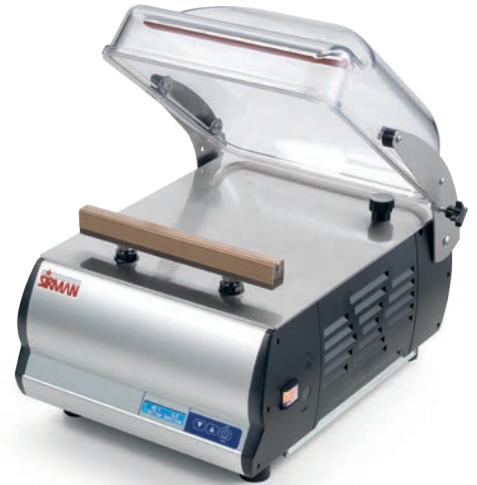
W8 30 DX EASY