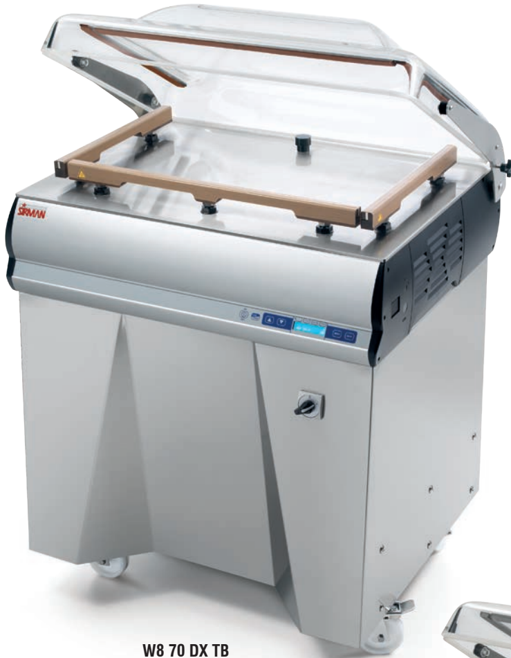
W8 70 DX TB