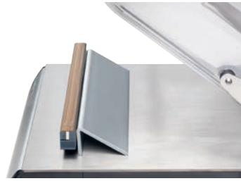
Standard support for vacuum bags with liquids