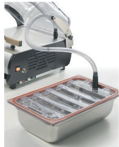
External vacuum: hose + GN container + lid Reinforced Gastronorm Containers and Lids