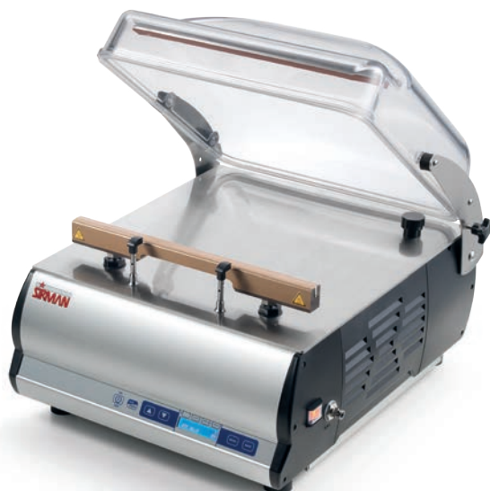
W8 40 DX