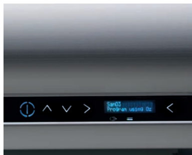
W8 Top 40-50 DX