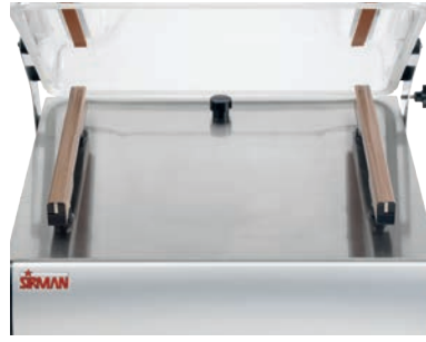
W8 50 DX DB 1 left and 1 right seal bars design