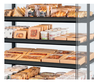
Ultimate product visibility transparent design, thin shelves, no distraction.