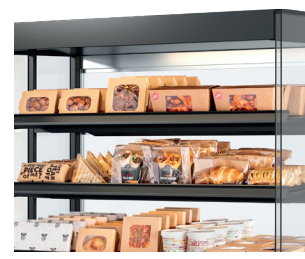
Food (literally) in the spotlights -LED lighting above each shelf.