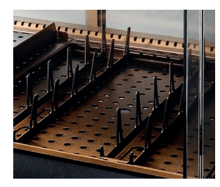
Wide range of accessories available.