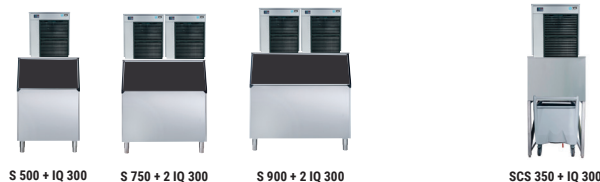
S 500 + IQ 300