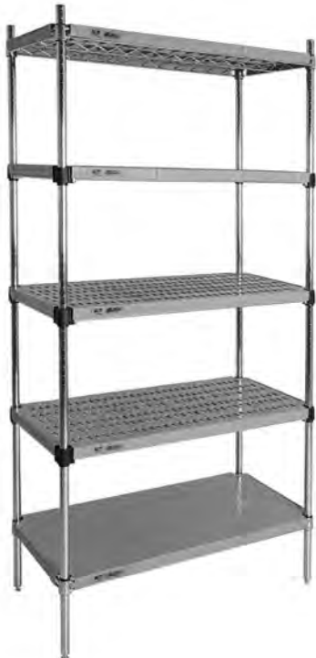
QuadPLUS® stationary starter unit

Eagle QuadPLUS®, model _____. Consists of (1) Standard truss frame with louvered QuadPLUS® green shelf mats; (3) Quad-Adjust® truss frames with louvered QuadPLUS® green shelf mats; (1) Standard truss frame with solid QuadPLUS® green shelf mats; and (4) 74" (1880mm) posts. Mobile units feature 5" (127mm) resilient swivel stem casters—two with brake.