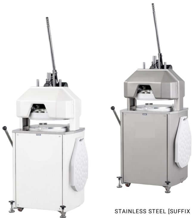
STAINLESS STEEL [SUFFIX I]