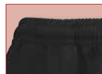
Elastic drawstring waist