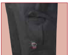
Cargo pockets with velcro closure