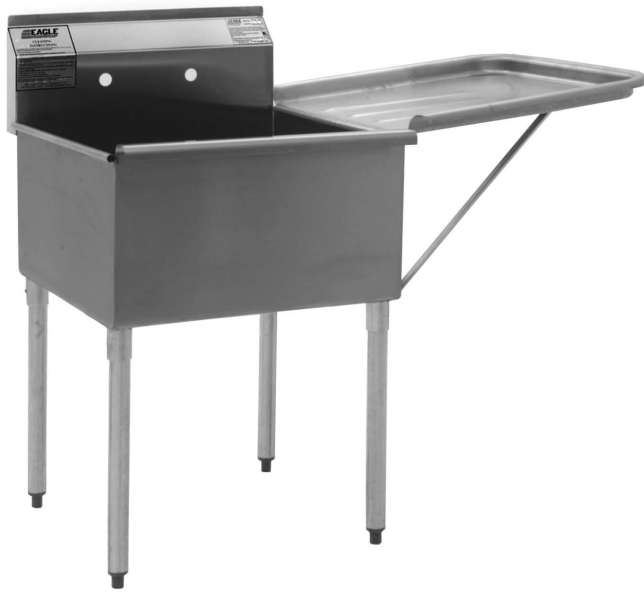
detachable drainboard shown attached to utility sink*

Eagle Detachable Drainboard for Utility Sink, model _____ . Constructed of type 304 or 430 stainless steel with die-stamped rolled rim construction. Left or right hand operation. Furnished with easy clip on installation.