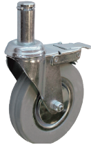
5" Industrial Caster With Brakes