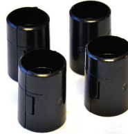
Black Abs Sleeves