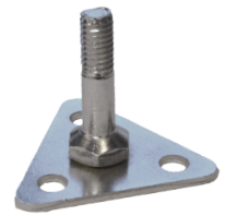
Foot Plate for Wire Shelving