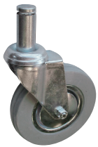
5" Industrial Caster Without Brakes