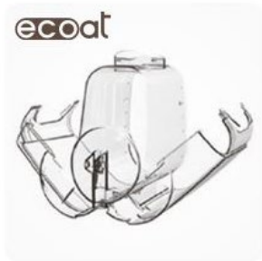
Energy Saving Less condensation system