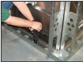
Step 4: Secure System To Floor