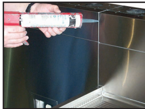
Step 5: Silicone Seams