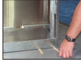
Step 3: Level System w/ Shims