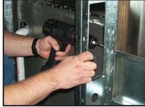
Step 2: Bolt Together w/ Self-Tapping Screws