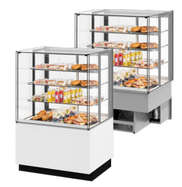
Models on underframe or drop-in version