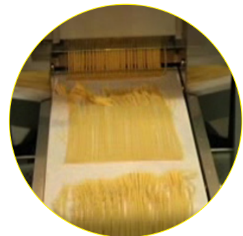
Optional Pasta Cutter (only available at time of order)

CAD file available. Please contact factory 717-394-1402. | Specifications subject to change without notice | © Copyright 2020 Arcobaleno™, LLC