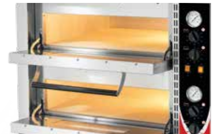
Refractory stone deck