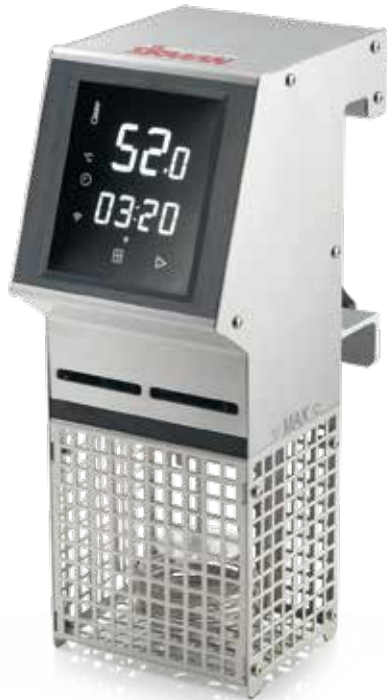
SOFTCOOKER WI-FOOD X