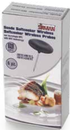
Pack with n.6 probes