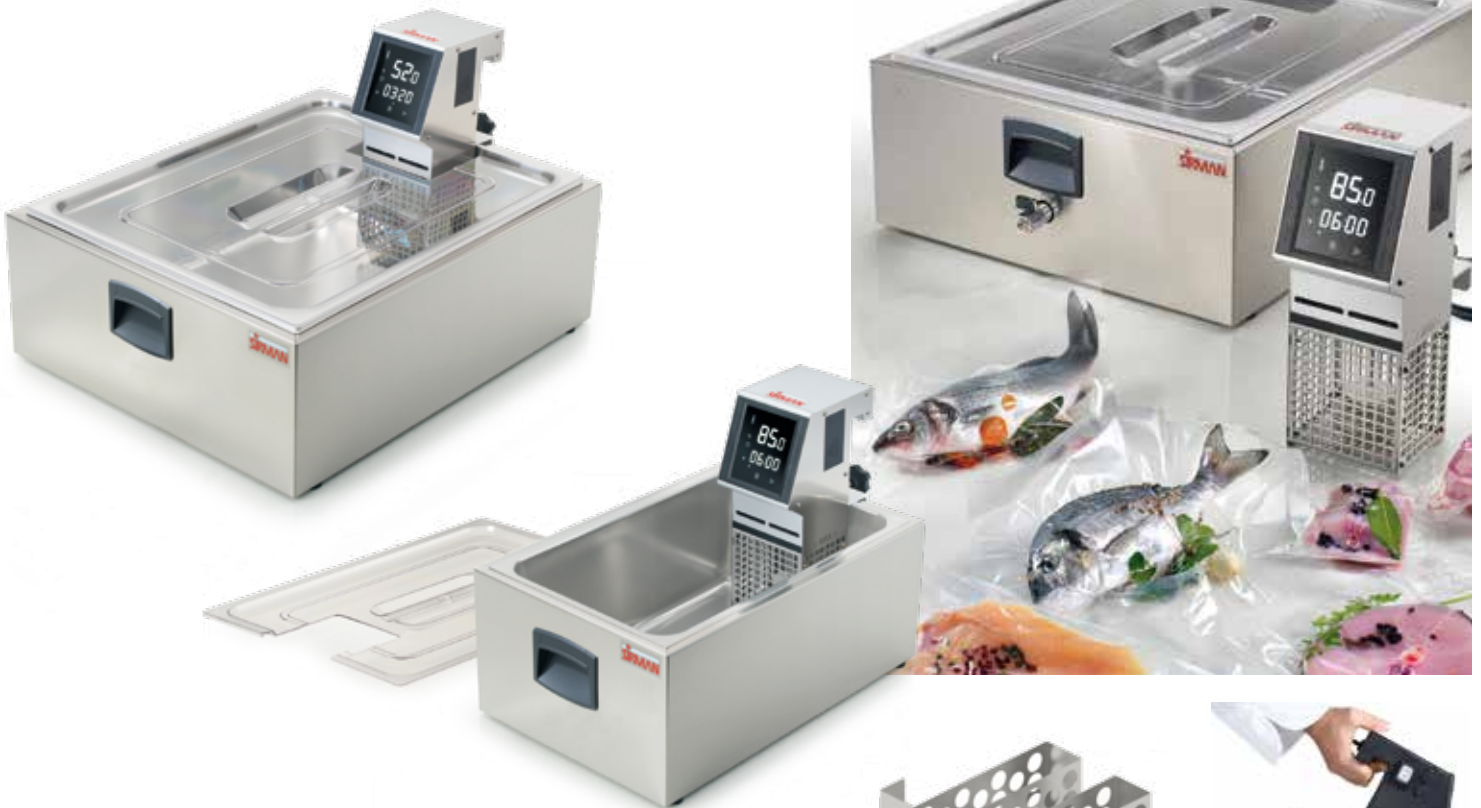
Optionals s/steel container with lid 1/1 and 2/1 GN