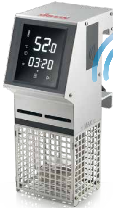
SOFTCOOKER WI-FOOD X NFC