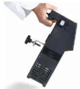
Easy to handle holder